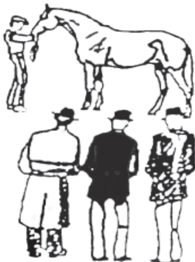
The Ground Jury inspects the Horse/Pony at the halt.

Once your number is called, enter the inspection area, walk 5 meters to the Halt zone, and salute the panel (President and members of the Ground Jury, and Veterinarian). Upon the signal from the President of the Jury, walk ahead 10 m and then trot on a loose rein 35m to the end of the area, circle the cone at the walk (horse on the inside, always visible to the panel), and trot back 50m and halt. The Veterinarian will complete his or her inspection. The President of the Jury will advise if your horse has been accepted, or must step into the holding area for a further inspection.